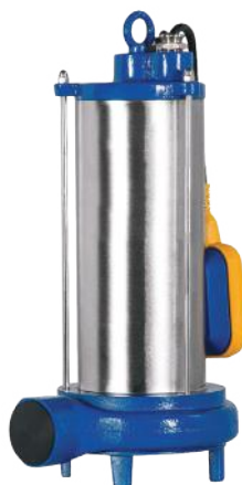
EFP 11 DP