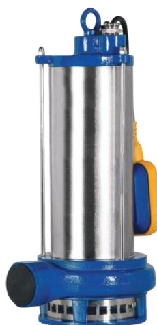
EFP 11 D