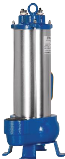
EFP 11 DV